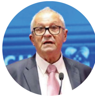
Joseph Sifakis Turing Award Winner