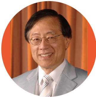
Andrew Chi-Chih Yao Turing Award Winner