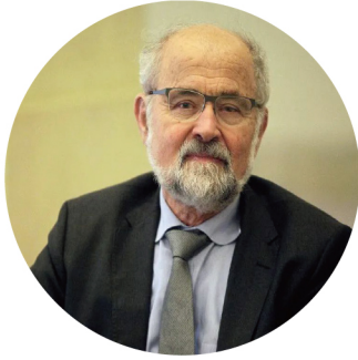
Erwin Neher Nobel Prize in Medicine