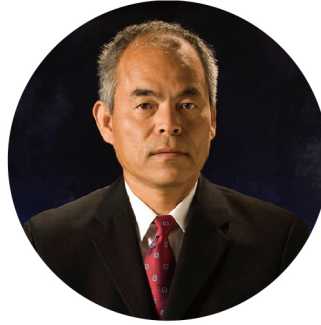
Shuji Nakamura Nobel Prize in Physics, Father of GaN Blue LED