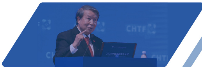
Low-altitude Economy & Space Conference

The X-Lake Forum is an international innovation forum organised by the Ministry of Science and Technology and the Shenzhen Municipal People's Government. Started in 2021, it has been bringing together international experts and scholars to share the latest advancements in science and technology.