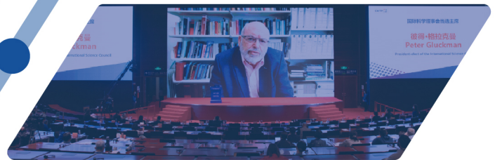
China's Specialized & Sophisticated Enterprises Technology Innovation Forum