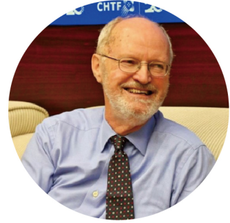
Robert Howard Grubbs Nobel Prize in Chemistry