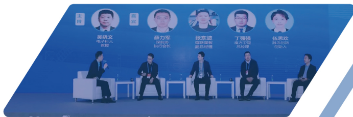
Global Scientific and Technological Innovation Investment Convention