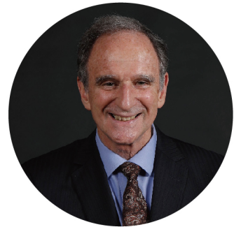
Martin Edward Hellman Turing Award Winner