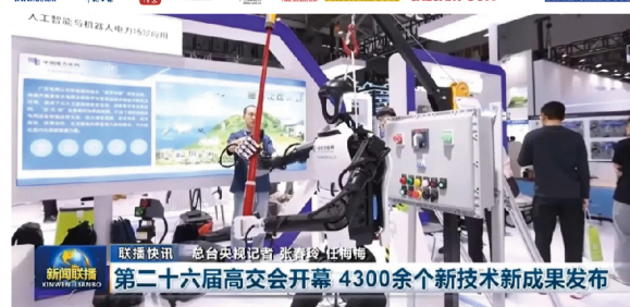
CCTV News Reports on the Grand Occasion of the 26th China Hi-Tech Fair